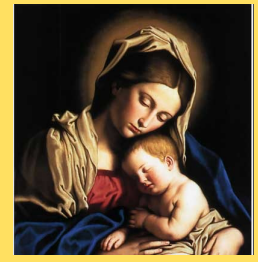
Feast of Mary, Mother of God