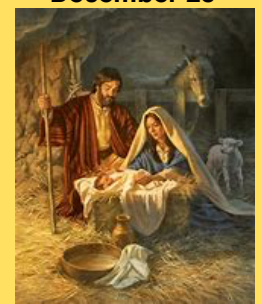
Feast of the Nativity